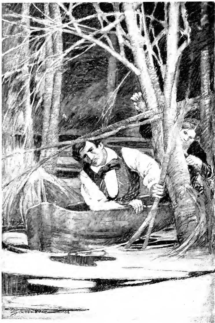
Neil forced the dugout through the water.—Page 142